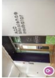
9 ACC BIOSCIENCE INCUBATOR 4,000 SF Fit Lab Space for Science Entrepreneurs to Focus on Innovation, Wet Labs, Two ISO 8 Clean Rooms, Conference Space Opened January 2017