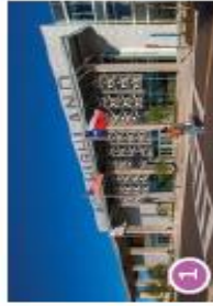
1 ACC HIGHLAND PHASE 1 Accelerator Learning Lab, Serving 6,000 Students Opened Fall 2014