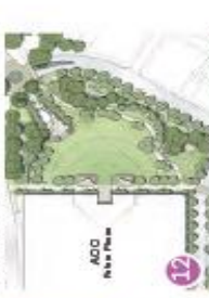
12 ST. JOHNS ENCAMPMENT COMMONS 2+ Acres of Planned Open Space Named in Honor of the African American Community Organization that Preceded the Mill at Highland