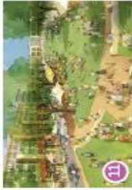
11 GATEWAY PLAZA Signature Open Space at Highland's Front Door Preserved Heritage Trees. Under Design Coming Summer 2019