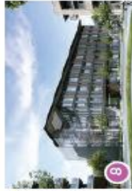
8 HIGHLAND 4 65,000 SF Build-to-Suit Class A Office Space, Large Floor Plates, Structured Parking w/ secure Access, Amenity Rich Under Design