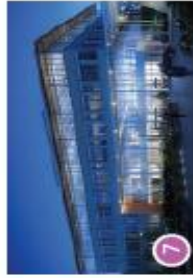
7 ACC ACADEMIC PARTNERSHIPS Designed by GenSL, 185,000 SF Class A Office, Curriculum Enhancements. Construction Start 8/16/2018