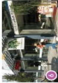
6 RETAIL & RESTAURANTS 25,000 SF Signature Retail Areas, Restaurants & Shops. Under Construction Coming Summer 2019