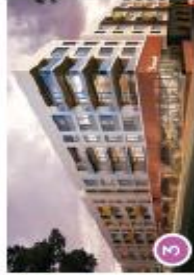
3 RESIDENTIAL PHASE 1 309 Total Apartment Units, 31 Affordable Housing Units, Ground-Floor Retail, LEED Certified Opened Fall 2017