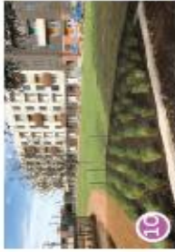
10 SOUTH GREENWAY PARK 2+ Acres of Public Open Space, Workout Areas, Trails, Picnic Areas. Substantially Complete Opens Early 2018