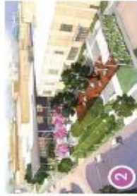
2 ACC HIGHLAND PHASE 2 Workforce Innovation Center, STEM Simulator Lab, Digital Media Center, Culinary & Hospitality Center. Coming Spring 2020