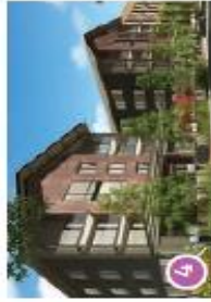
4 RESIDENTIAL PHASE 2 & 3 Approx. 350 New Apartment Units. 39 Affordable Units. Under Construction Coming Summer 2019