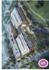
5 PLANNING & DEVELOPMENT CENTER Proposed 250,000 SF Office Space for the City of Austin Coming Fall 2019